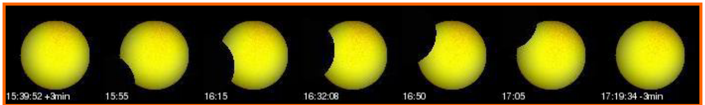
WHAT YOU WILL SEE OF THE ECLIPSE IN NAY PYI TAW – 13.2%

➤ This document is the property of SODAP-SOBOMEX and protected by the international authors laws and the protection of the intellectual property.