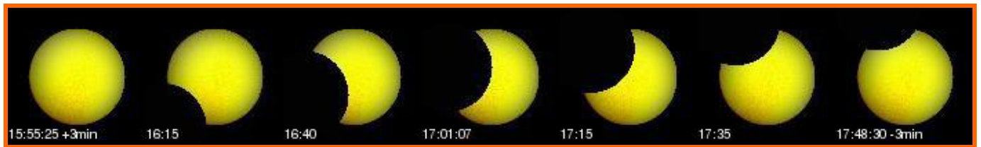
WHAT YOU WILL SEE OF THE ECLIPSE IN ATTAPU – 38.4%