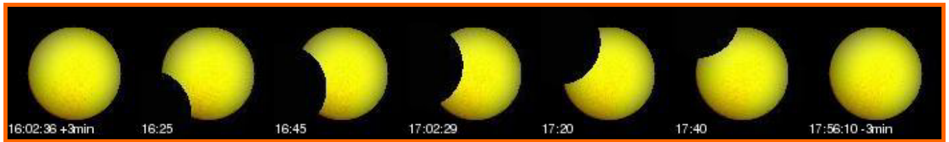
WHAT YOU WILL SEE OF THE ECLIPSE IN VIENTIANE – 24.5%

➤ This document is the property of SODAP-SOBOMEX and protected by the international authors laws and the protection of the intellectual property.