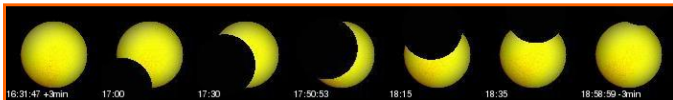
WHAT YOU WILL SEE OF THE ECLIPSE IN KUALA LUMPUR – 63.8%

> This document is the property of SODAP-SOBOMEX and protected by the international authors laws and the protection of the intellectual property.