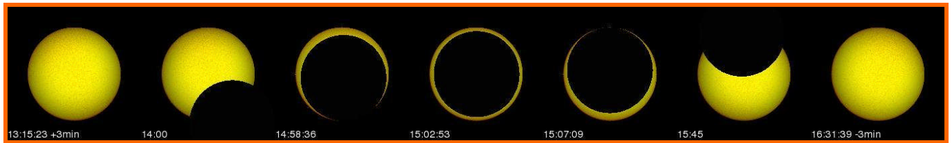
WHAT YOU WILL SEE OF THE ECLIPSE IN AKYAB (SITTWE) – 83.6%