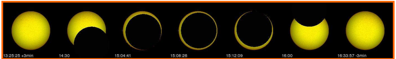
WHAT YOU WILL SEE OF THE ECLIPSE IN MANDALAY – 83.5%