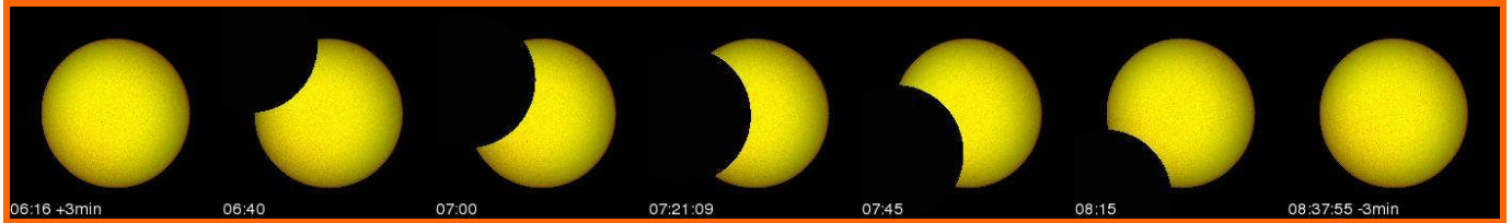
WHAT YOU WILL SEE OF THE ECLIPSE IN LUSAKA – 35.2%

➤ This document is the property of SODAP-SOBOMEX and protected by the international authors laws and the protection of the intellectual property.