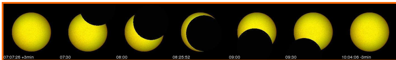
WHAT YOU WILL SEE OF THE ECLIPSE IN JUBA – 78.7%