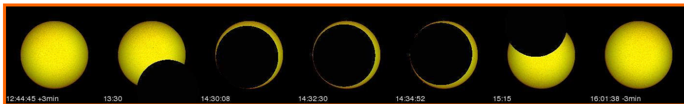
WHAT YOU WILL SEE OF THE ECLIPSE IN COX'S BAZAR – 83.6%