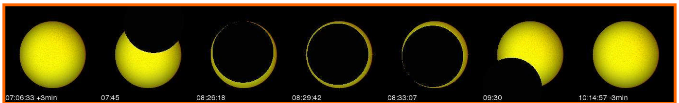
WHAT YOU WILL SEE OF THE ECLIPSE IN NAIROBI – 83.3%

> This document is the property of SODAP-SOBOMEX and protected by the international authors laws and the protection of the intellectual property.