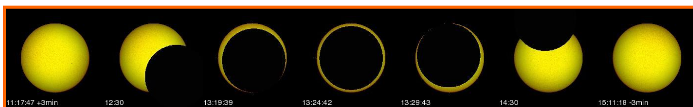
WHAT YOU WILL SEE OF THE ECLIPSE IN JAFFNA – 84.3%