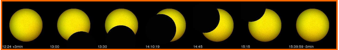
WHAT YOU WILL SEE OF THE ECLIPSE IN KATHMANDU – 57.8%

> This document is the property of SODAP-SOBOMEX and protected by the international authors laws and the protection of the intellectual property.